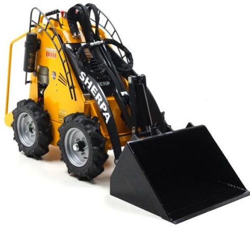
SKID STEER LOADER