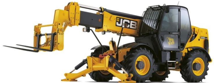
TELE HANDLER FORKLIFT